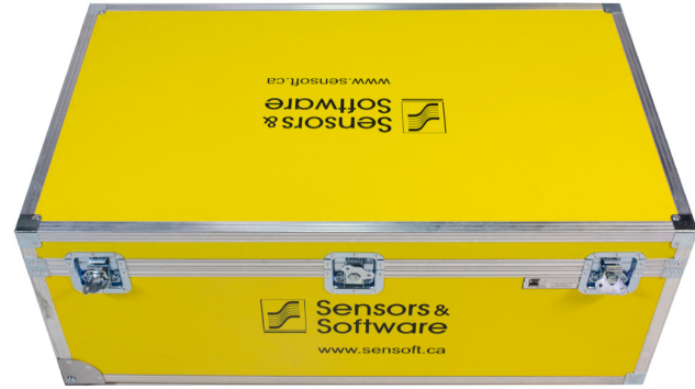
100-60-0061 LMX150™ FINDAR® Series ATA Shipping Case (with DVL Bag)