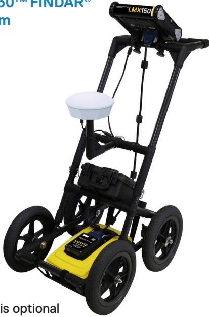
100-10-0178 LMX150™ FINDAR® System