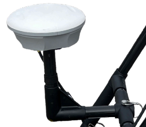
100-54-0150 AG-200 GPS Kit for LMX150™ FINDAR®