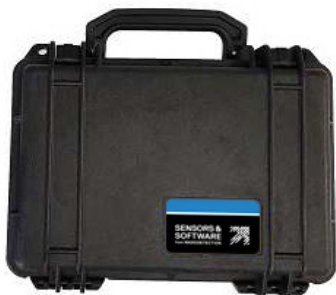
100-55-0023 Spare Battery