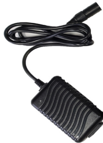
100-55-0027 Spare Battery Charger