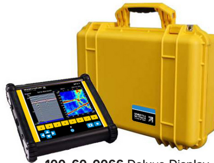
100-60-0066 Deluxe Display Unit Carrying Case